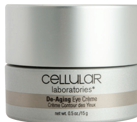
Cellular Laboratories® De-Aging Eye Crème (a.m./p.m.)