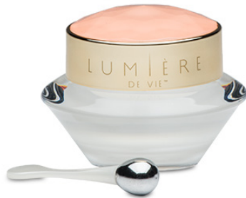
Lumière de Vie® Eye Balm (a.m./p.m.)