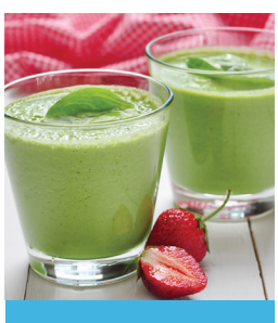
A.M. SNACK Strawberry & spinach shake