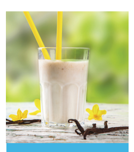
POST WORKOUT TLS' Nutrition Shake