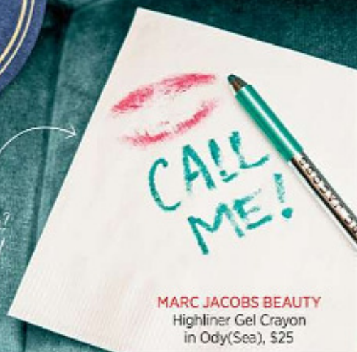
MARC JACOBS BEAUTY Highliner Gel Crayon in Ody(Sea), $25

Who says he has to make the first move? Be brave and send him a cute note!