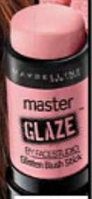
MAYBELLINE Master Glaz Glisten Blus Stick, $9.99