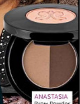
ANASTASIA Brow Powder Duo in Dark Brown, $23