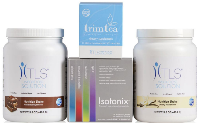
ISOTONIX® DAILY ESSENTIALS PACKETS, TLS® TRIM TEA AND TLS® NUTRITION SHAKE