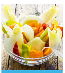
P.M. SNACK Vegetable medlev