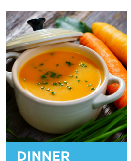
Spicy carrot soup