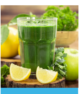
A.M. SNACK Green smoothie