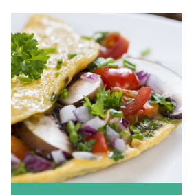
BREAKFAST Veggie omelette

You're extremely committed to achieving swift weight-management goals through an effective program. You'll shed fat and feel better, physically and emotionally, knowing you can do anything you set your mind to.